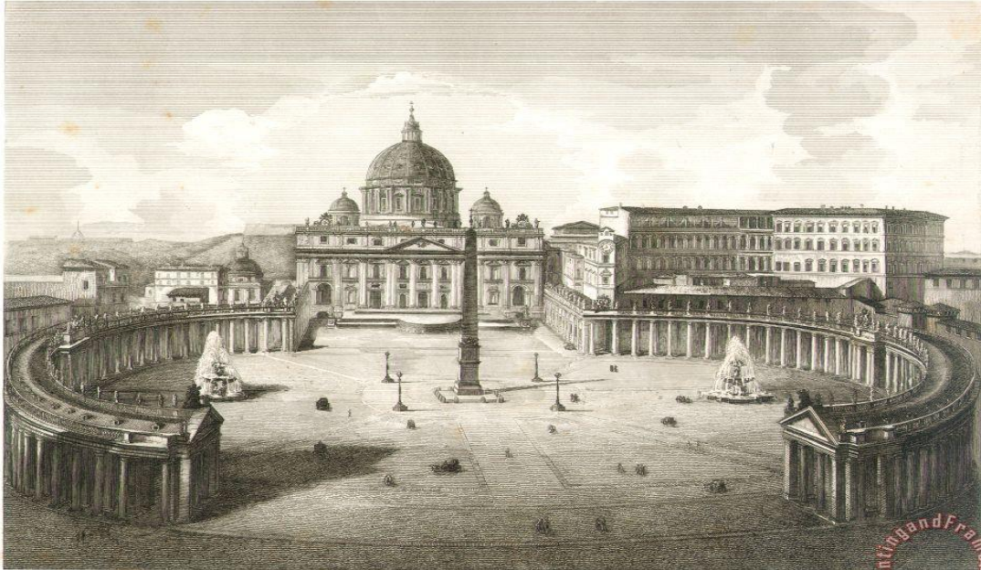
PIAZZA DI S. PIETRO IN VATICANO