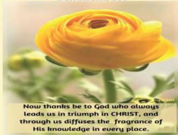
2 Corinthians 2:14