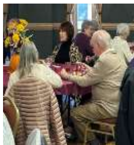
The 55 & Up Group had a Pre-Thanksgiving Dinner on Sunday, November 12 th . Good

food and fellowship were enjoyed by all. If you would like to join the group the fee is $15 a person and $20 a couple. You must be a member to attend our meetings and events. Any questions contact the Rectory Office at 610-687-3366.