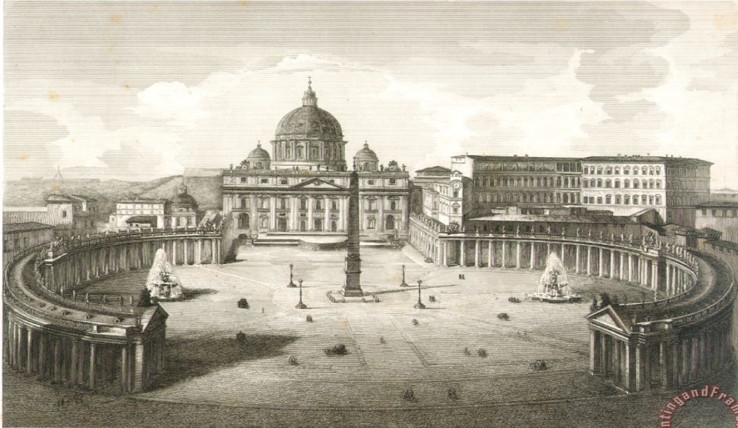
PIAZZA DI S. PIETRO IN VATICANO